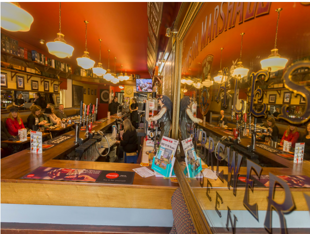
St Machar Bar

more regular visits to our rare classics may not have prevented the sad loss at least we could have managed to get a decent collection of photos before this classic bars's crown jewels were permanently shorn from the fixtures and fittings of what is now a warm and friendly, but not quite so gleaming, establishment