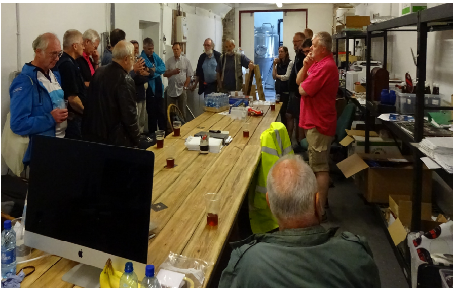
Members sampling Deeside Brewery Hospitality