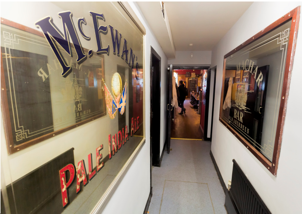
St Machar Mirrored Corridor